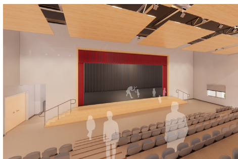
Architect's rendering of the multipurpose room/auditorium, and sample of seating style. Please note: The photo of seating is to demonstrate the style, not the colors.