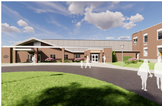
Architect's rendering of the building exterior after renovating the courtyard, and a small section of the library to construct the multipurpose room/auditorium.

Q Is there a floor plan and what will the proposed work look like?