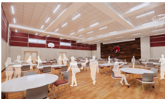
Architect's rendering of renovated and modernized cafeteria.